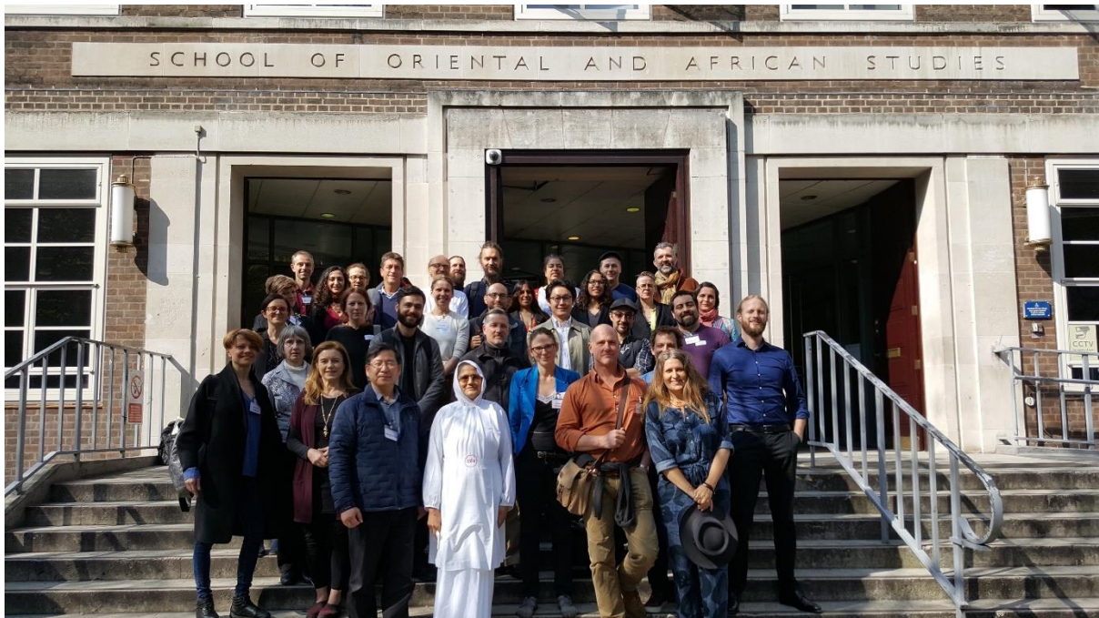
Routledge Handbook of Yoga and Meditation workshop participants outside SOAS 29 March 2019.