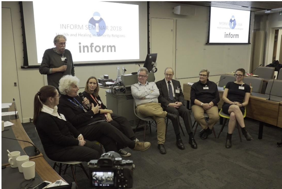
Panel Discussion at the Health and Healing Seminar November 2018

The new Inform website, built and paid for by M&C Saatchi under an in-kind grant received from the Home Office's 'Building a Stronger Britain Together' programme, was officially launched at this seminar. A representative from M&C Saatchi gave a short presentation on the website. It was generally well received with some mixed views about the new Inform logo.